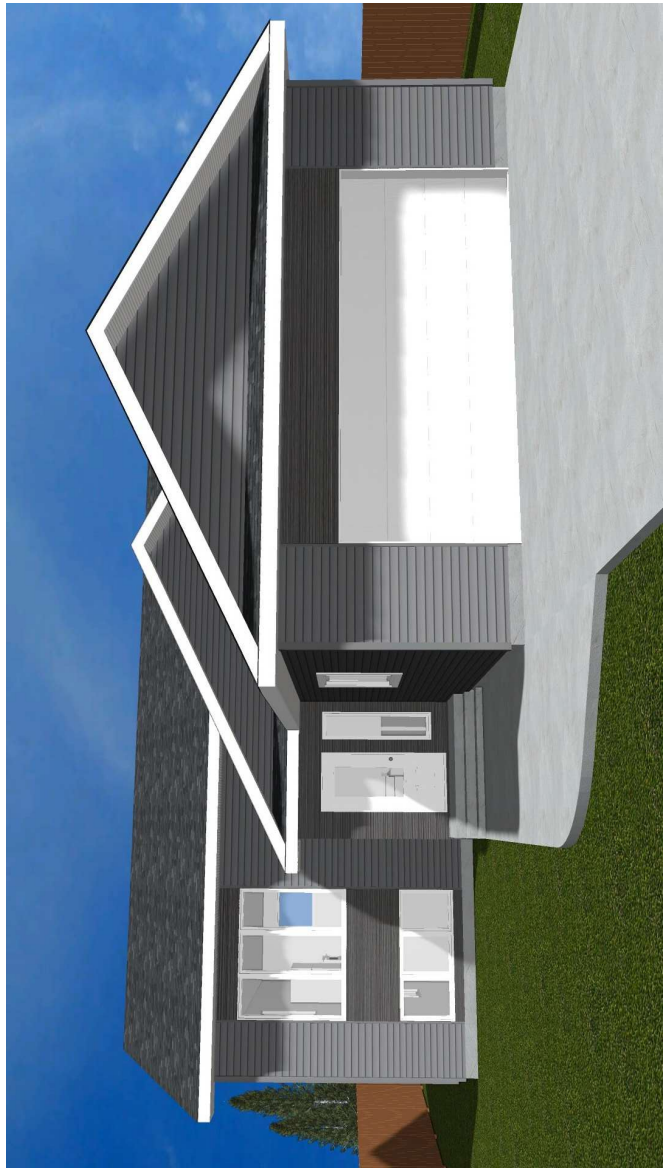
#12 SHARON PLACE 1 432 SF.